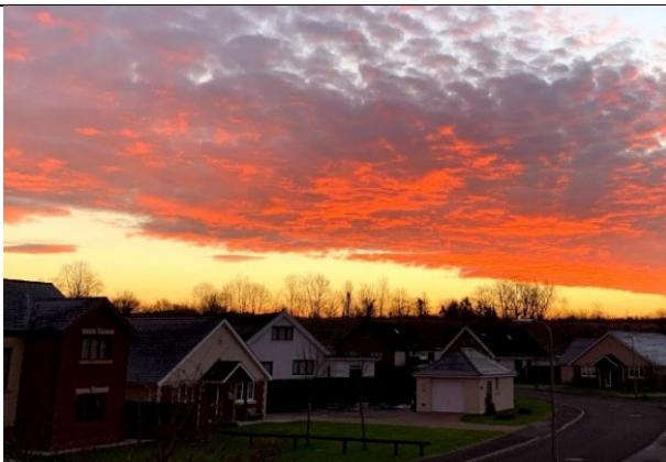
Beautiful sky over Nant y Ynys