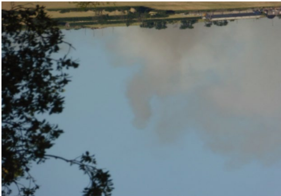
Cwmwl o fwg dros Gwmduad