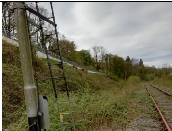
Repaired A484 from the Gwili Railway