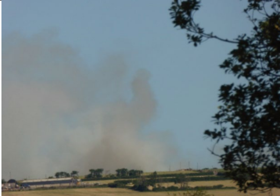
Smoke over Cwm Duad