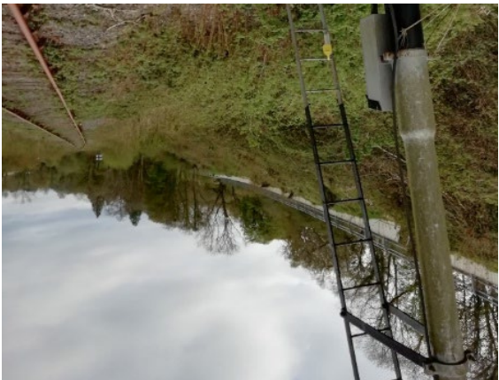
Dan yr heol atgyweirwyd ger Pante Bronwydd