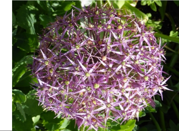
Blodau godidog er gwaethaf y rhew caled