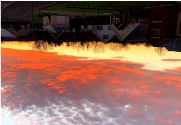
Wybren hardd dros Nantyrnys