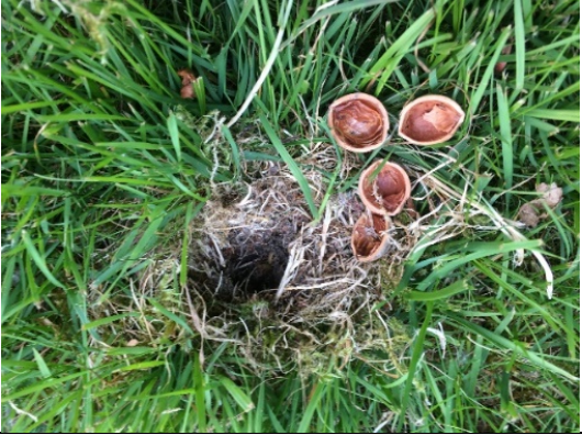
Y wiwer fach gyfrwys yn dod o hyd i'w chnau