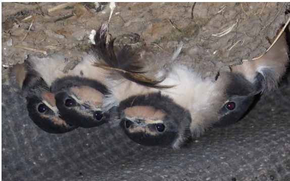
Mae 4 o wenoliaid babanod bron yn barod i'w tynnu - gyda gogls