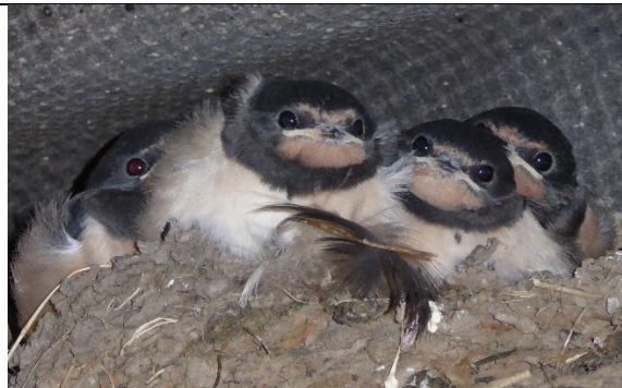
4 baby swallows nearly ready for take off – with goggles