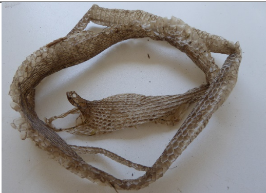
Complete grass snake skin just sloughed off, 110 cm long