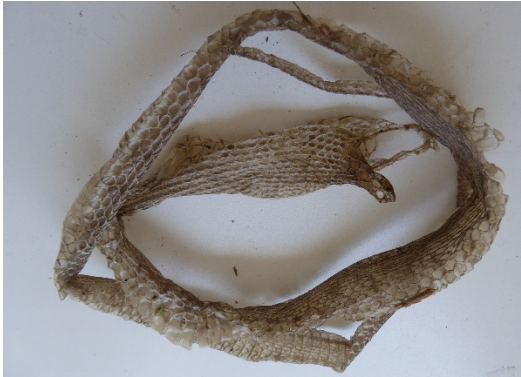
Croen neidr glawsellit cyflawn wedi'i arafu, 110 cm o hyd