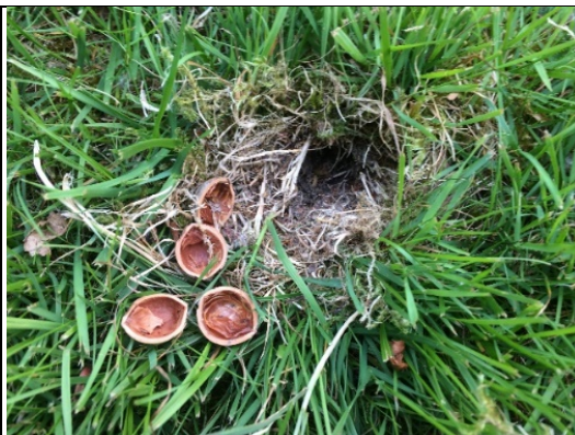
What a clever squirrel – he found his nuts!