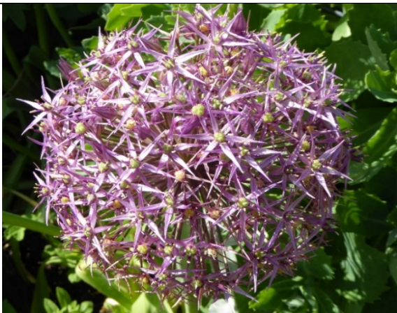
Beautiful delicate flowers despite the hard frost