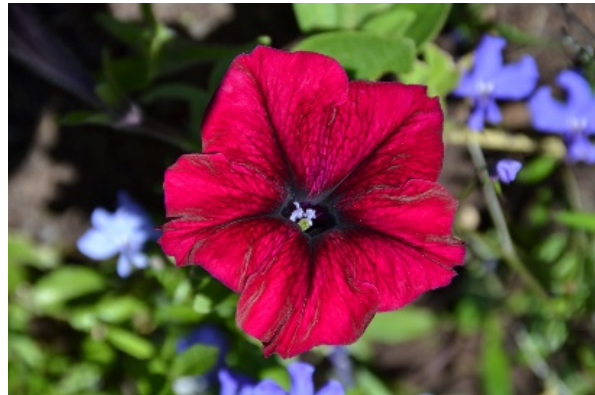
Enillydd cystadleuaeth "Floral" gan Tina