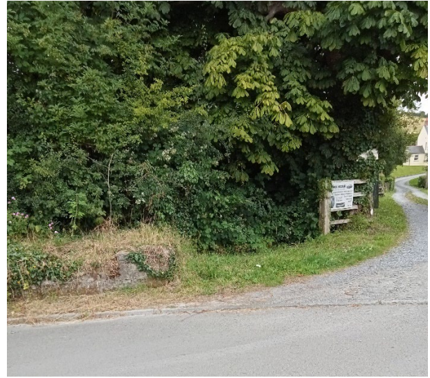
Below Coopers hill