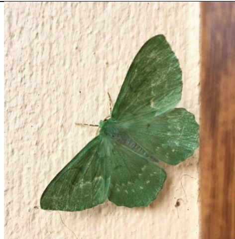
Large Emerald Moth