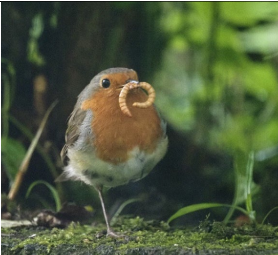
Ambell ddiwrnod yn well na'i gilydd .....