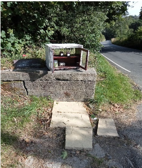
Bryncene above Graig Hill