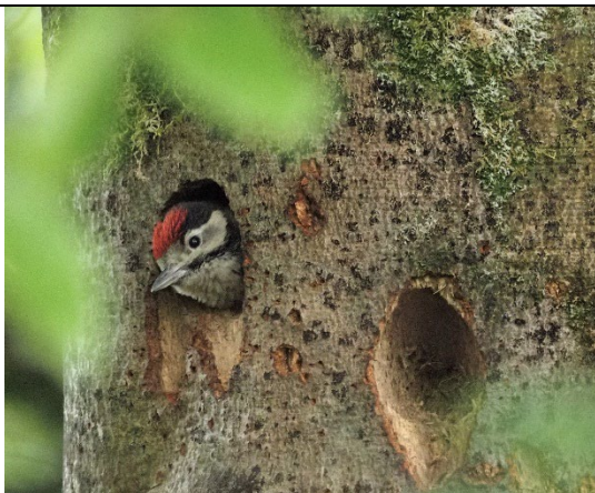
Nearly Time to go - Clare Bishop