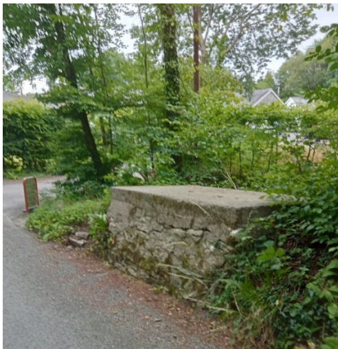
Mynedfa'r Felin Llanpumsaint