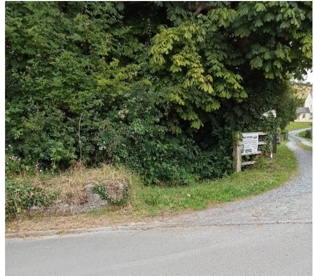
Ar waelod Rhiw Cwper