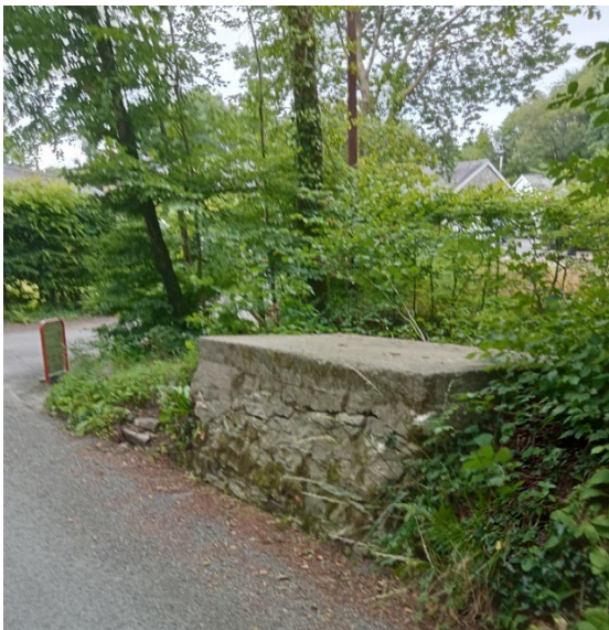
Entrance to Y Felin Llanpumsaint