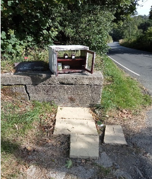
Brycene cyn Rhiw Graig