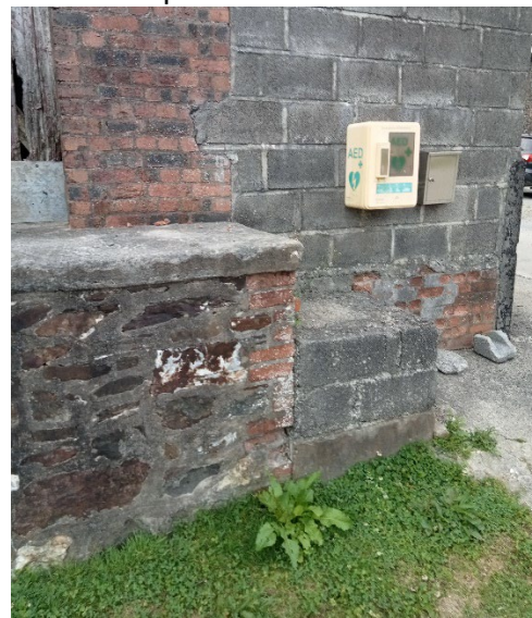
Henfryn Farm Ffynnonhenri