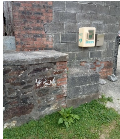
Fferm Henfryn Ffynnonhenri