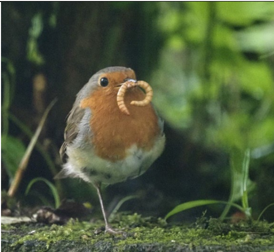
Some days are good .....

Brechfa Forest West Wind Farm Community Fund provides some funding for Village Voice and our website www.llanpumsaint.org.uk . We also receive funding from Llanpumsaint Community Council and all our advertisers. We thank them all for the support.