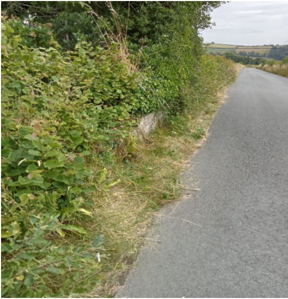
Ffynnonfelen wedi Nebo tua Bronwyd