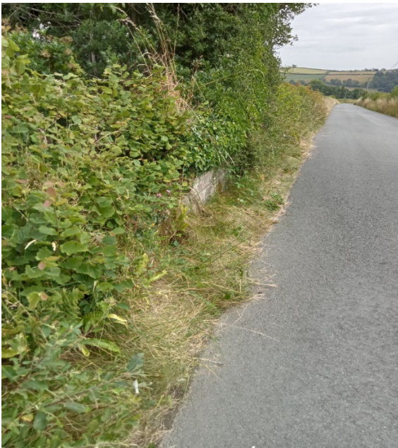
Ffynnonfelen - Below Nebo towards Bronwydd