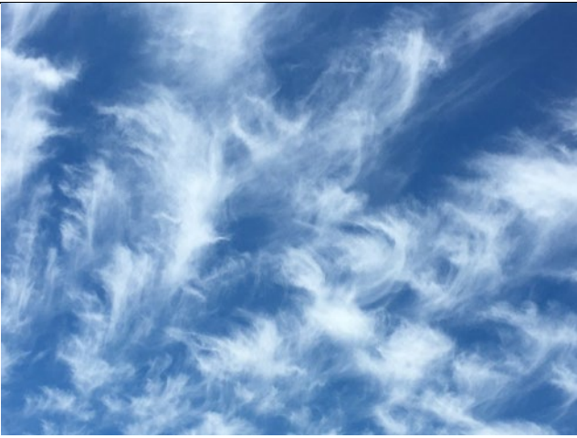
Cirrus cloud formation called a mare's tail sky. It's the best one I've ever seen. Ray Davies