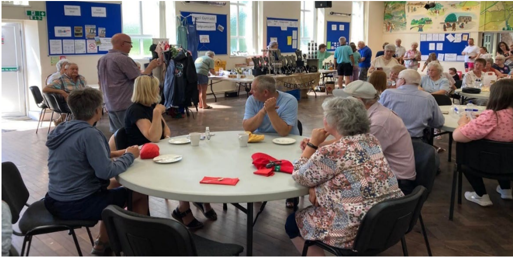
Bore Coffi in aid of the Carmarthenshire Urdd Eisteddfod

Many thanks to everybody who contributed towards the success of the Coffee Morning that was held on July 16 2022. It was a very successful event and the grand proceed of £1300 was made. Again many thanks for your support which is greatly appreciated.