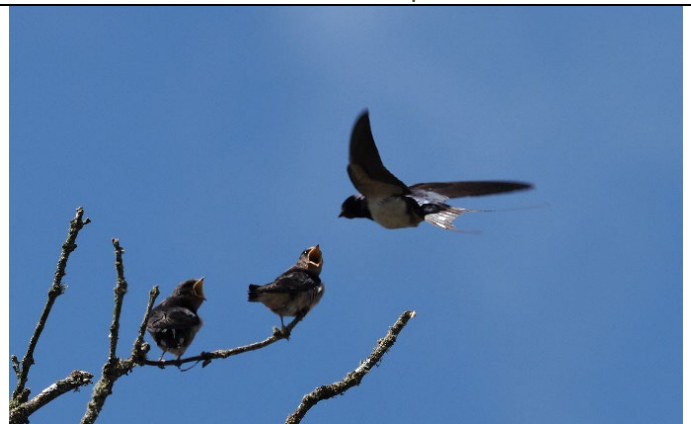
Feed me! – Clare Bishop