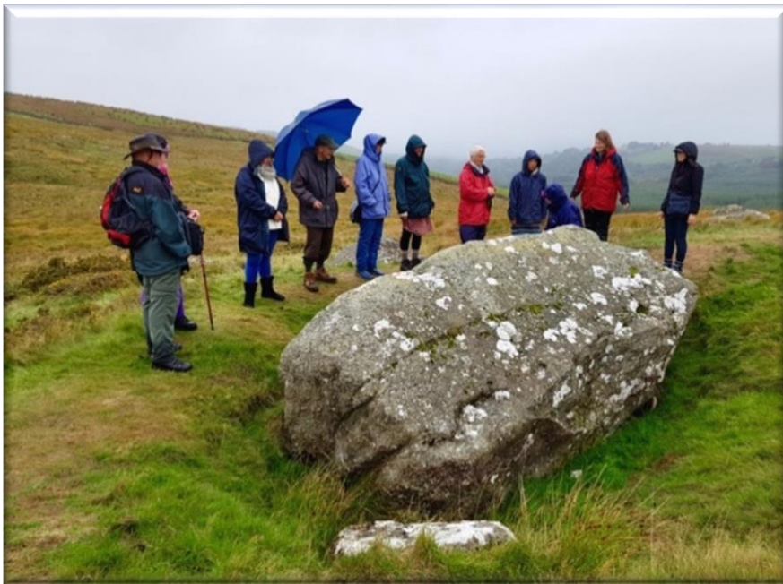
Carreg y Bwci