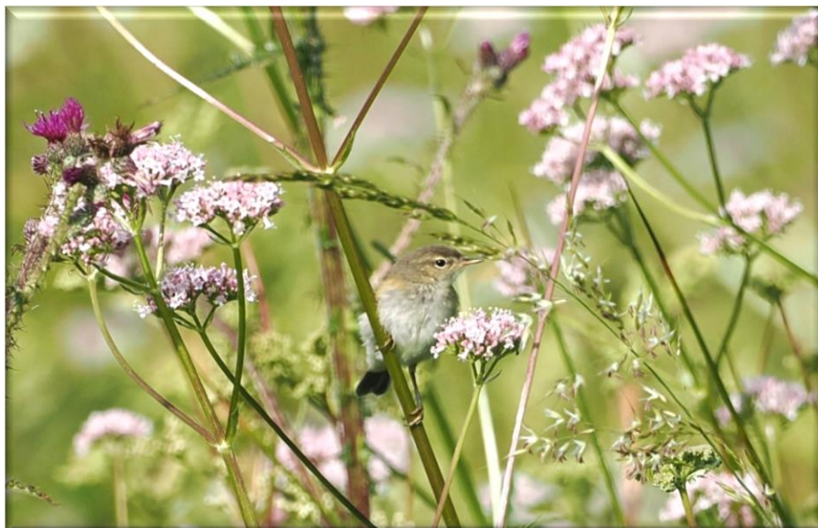
Garden warbler amongst valerian and thistles (Clare Bishop)