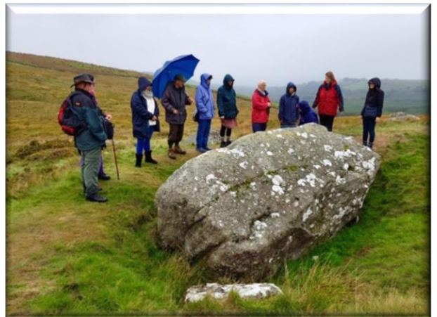
Carreg y Bwci