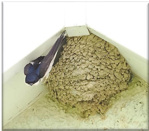
Gwennol y bondo

Mae yna ddiweddarau ynghyn a bywyd gwyllt ar Facebook - https://www.facebook.com/groups/262032303472937