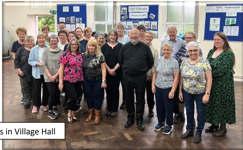
Line dancing class in Village Hall

We thank Brechfa Forest West Wind Farm Community Fund for helping to fund Village Voice and www.llanpumsaint.org.uk with £3000 a year from 2019 for 10 years (totalling £30000).