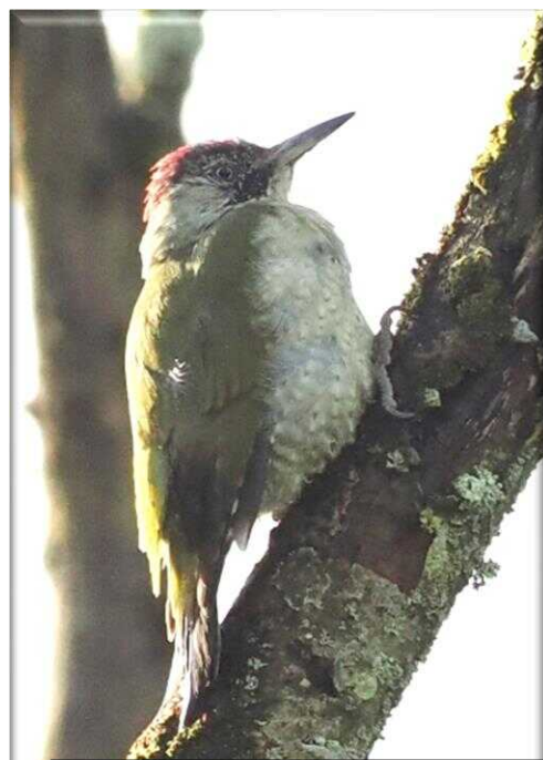
Juvenile green woodpecker