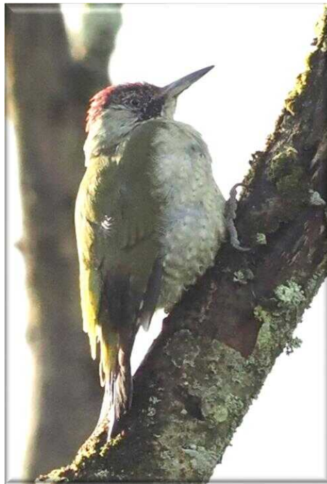
Cnocell y Coed gwyrdd