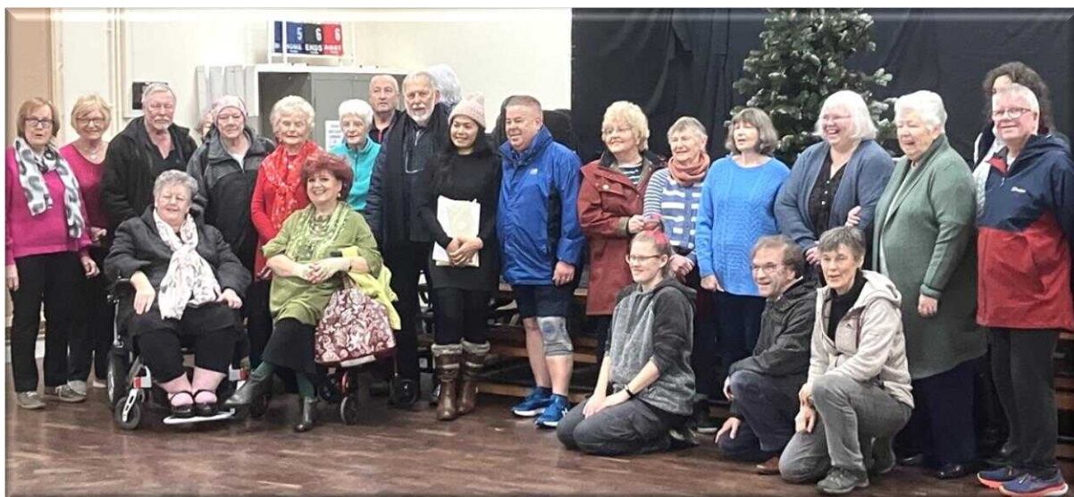
Farewell to Derick our postie