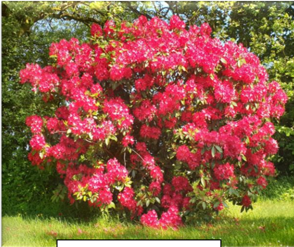
Glorious colour