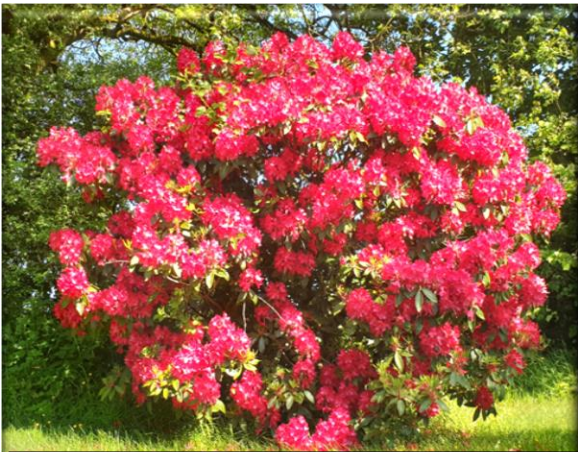
Lliwiau godidog