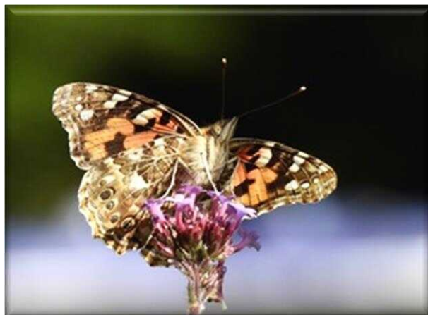
Pili-pala – Sally Chitty